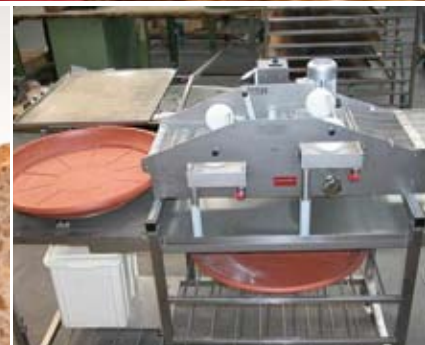
Dampening and seeding station (optional)