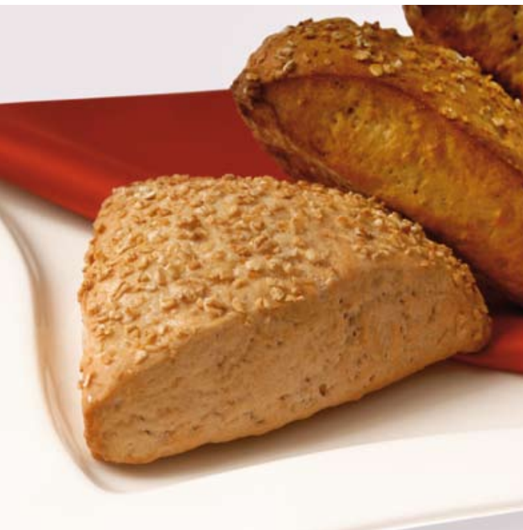
For Ciabattas and angular bread rolls